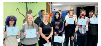
B Honor Roll