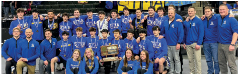
2025 Wrestling State Champions.