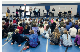
4th graders watch a band demonstration from current middle school students.

Each year, our 4th graders finish their time at St. Michael Elementary and prepare for middle school. To help them, they watch band and choir demonstrations, learn about daily life in middle school from staff, visit the middle school, and practice using lockers to get their materials. These activities help them feel ready and more comfortable for this big change.