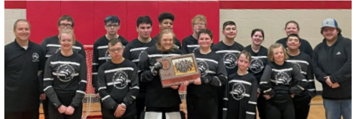
Buffalo/Monticello/STMA Coyotes qualified for the state tournament.

The Buffalo/Monticello/STMA Coyotes qualified for the state tournament for the first time in program history. Great season by our players and coaches!