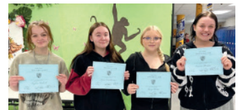
A Honor Roll

Every six week term, Knights Academy has an honor roll presentation in front of the entire school to recognize students that have made the A and B Honor Roll. In an alternative school setting, where students may face unique challenges, an honor roll can be especially meaningful in recognizing progress and perseverance, not just traditional academic success.