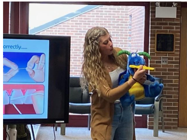
(EV Dental presentations)