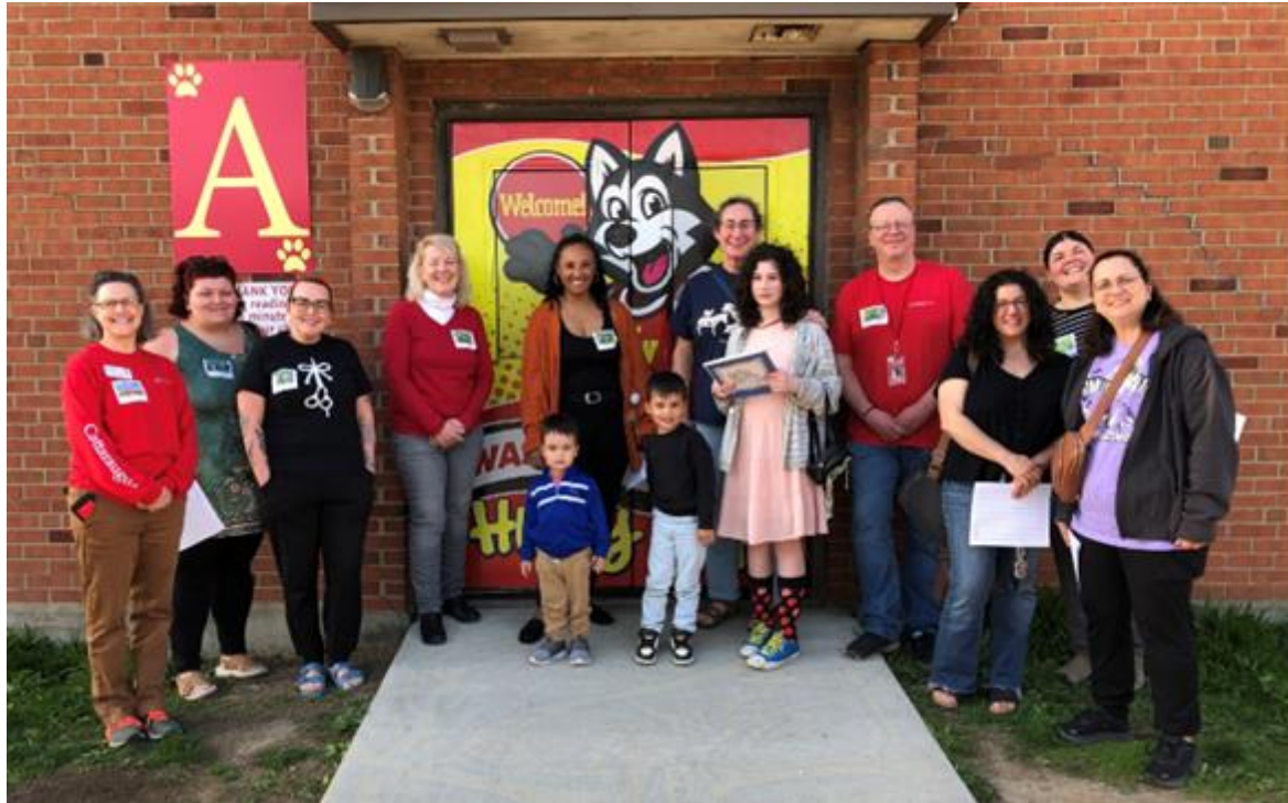
(Seed to Supper Gardening Program)