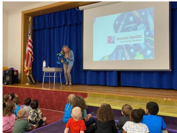
(WW dental presentations)