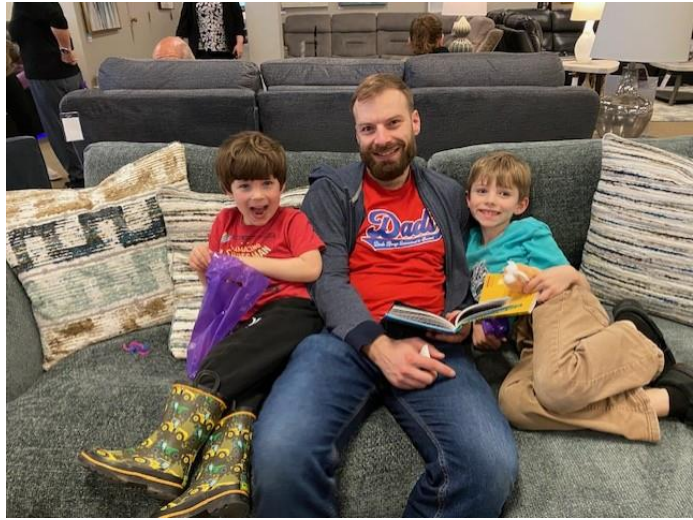
(WW Husky Hunt)