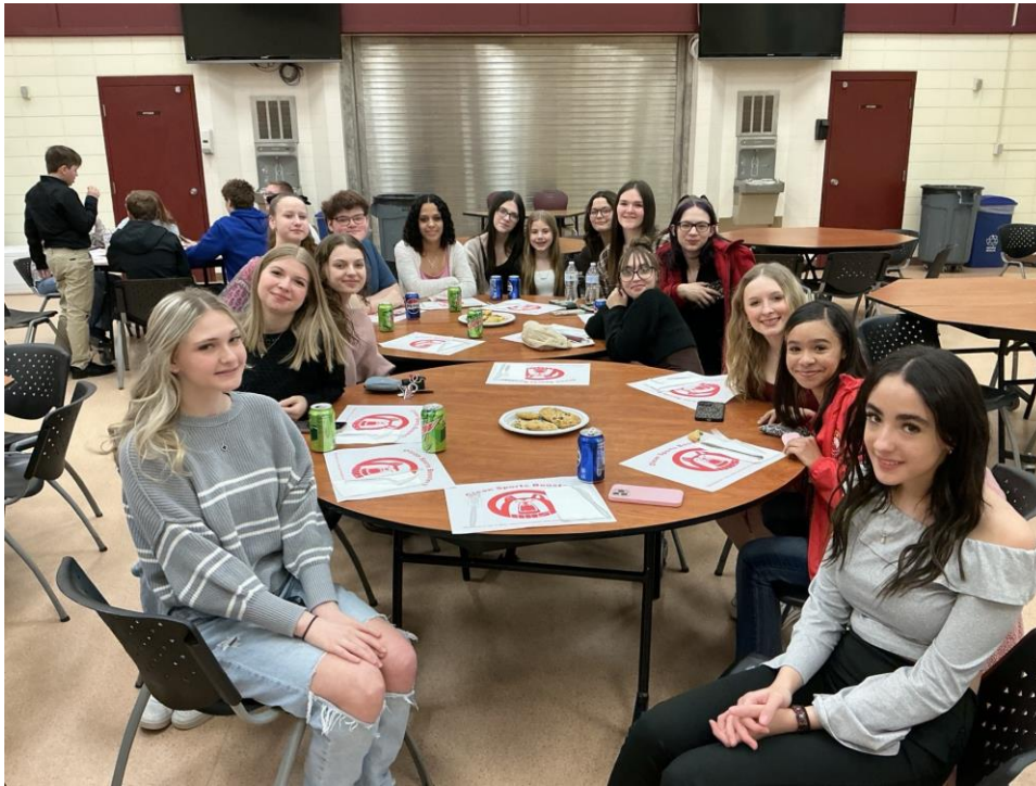
Winter Sports Banquet

Enjoy the pictures below of some events we've had!