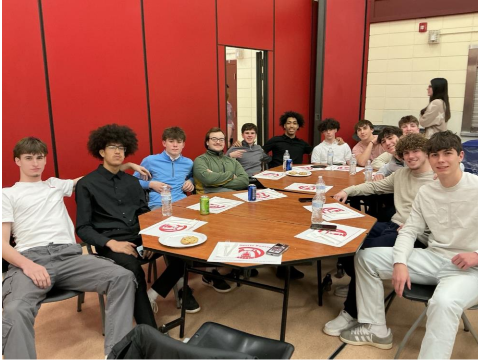
Winter Sports Banquet