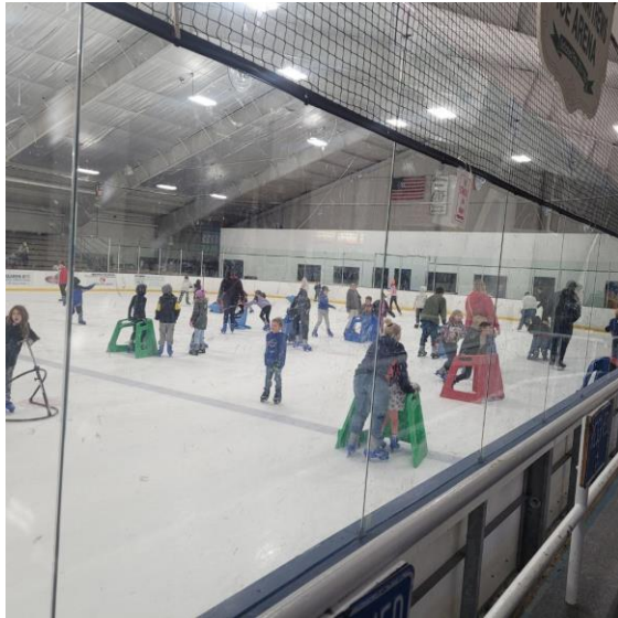
(EV Family Skate)