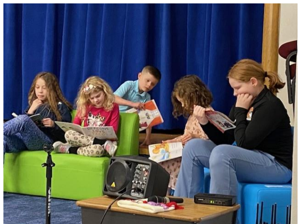
(WW Masked Reader Night)

Thanks for Reading about all our wonderful events!