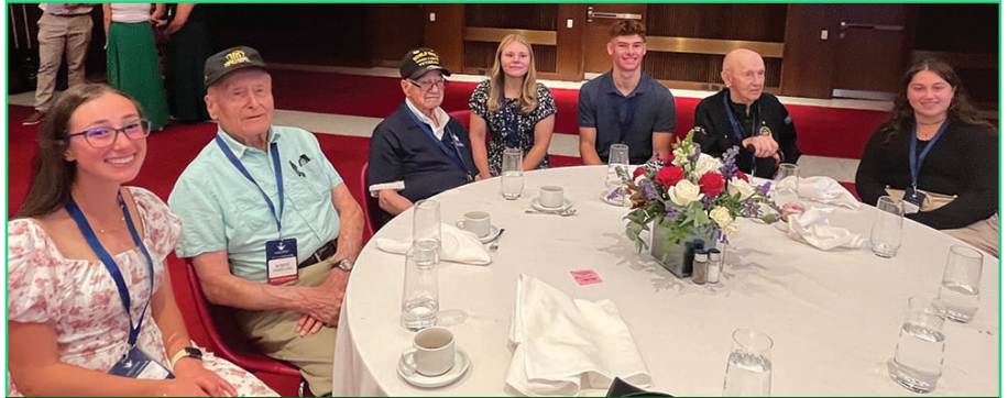
Seaford High School students met World War II veterans as part of the Gary Sinise Foundation's Soaring Valor Trip.