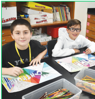
The arts are a vibrant part of a Seaford education.