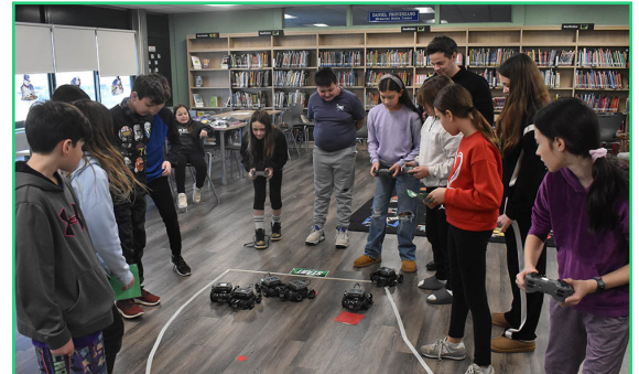
The elementary LIFT program features a new robotics unit.