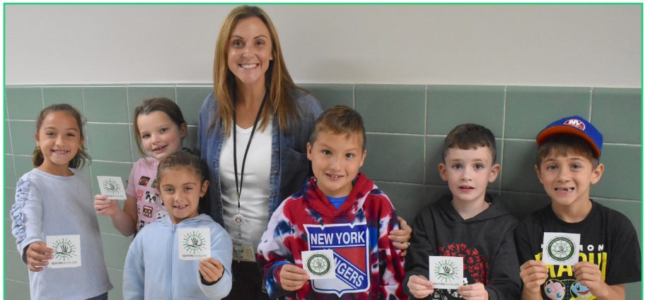
The 10 Seaford Scholar traits are part of everyday life in the schools.

VOTE! TUESDAY, MAY 20 – 7 A.M. TO 9 P.M.