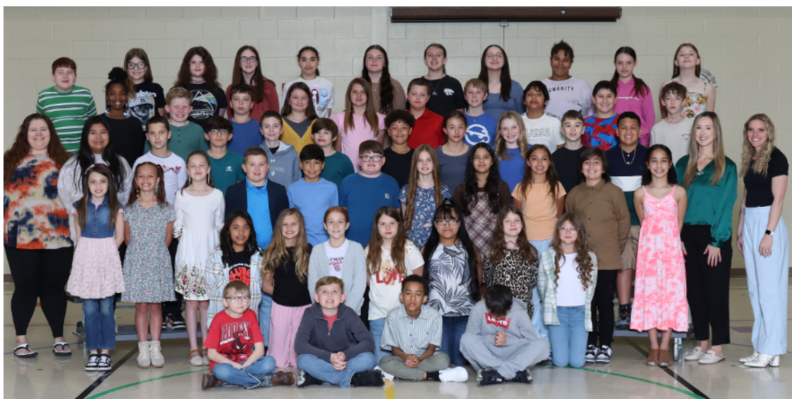
Class of 2032 - Grade 5 students and teachers.