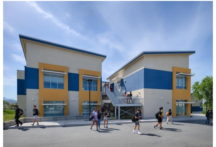
Heritage High School – 12 New Classroom = $11,338,165

Coming in 2025 - Heritage High School - Environmental Science Center