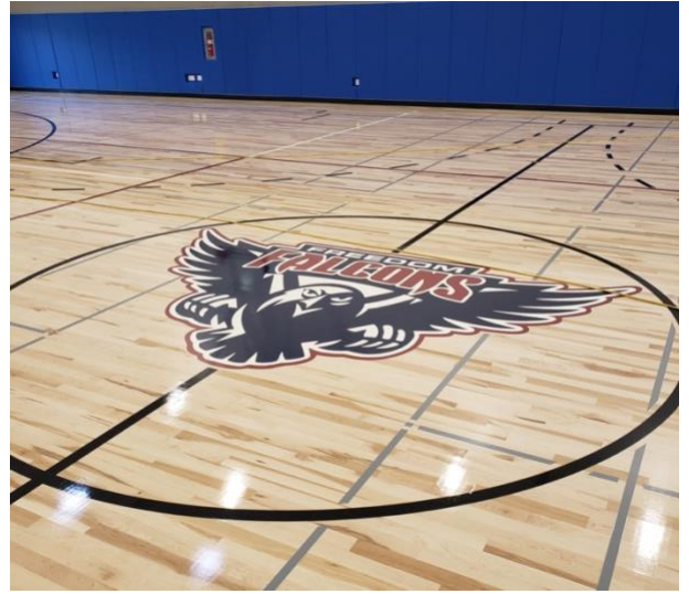
Freedom High School – Auxiliary Gym = $7,442,049