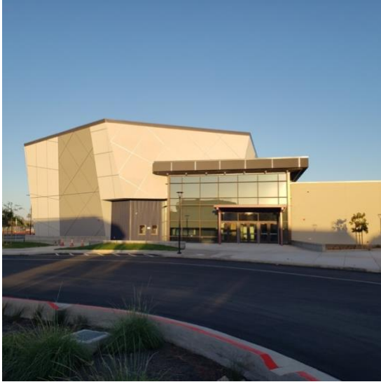
Freedom High School – Theater Building and Building Technologies = $27,406,556