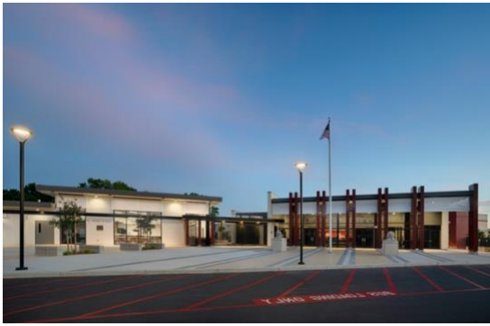
Liberty High School – Administrative, New Classrooms, Cafe = $54,257,599