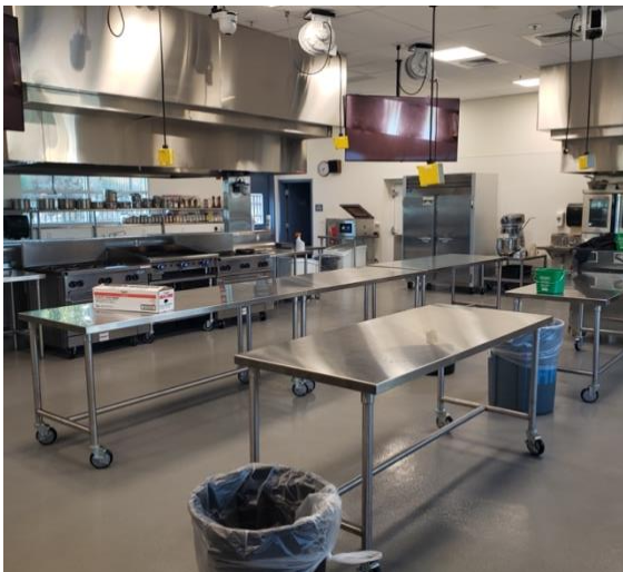
Heritage High School – Culinary Arts Building = $3,975,421