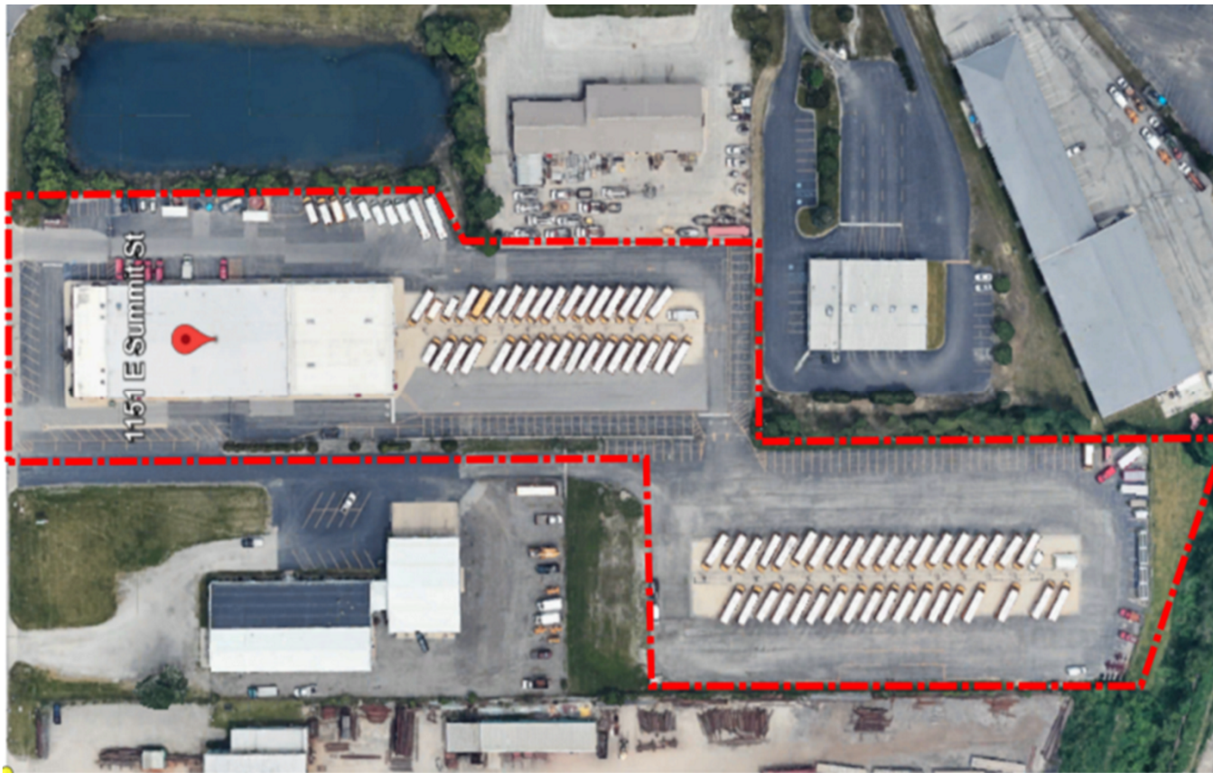
Crown Point Transportation Center