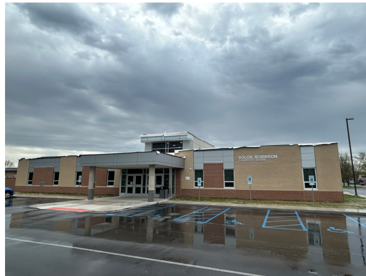
Exterior View of New Entrance