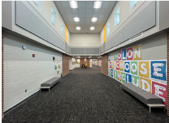
New Clerestory Entrance