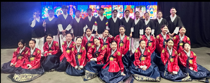
Cedarlane Academy Korean Dual Immersion Program (KDIP) students performed fan, drum, and Samulnori performances at the CABE Conference on March 28.

Stay up to date with our District's news and announcements on our webpage.