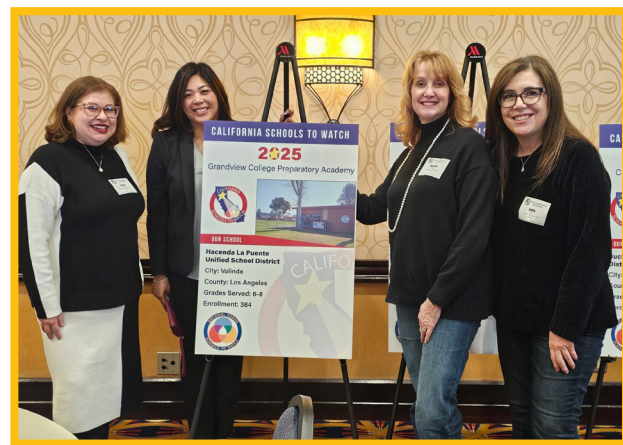
Grandview College Preparatory Academy attended the California League of Middle Schools Conference from March 6 to 7 to accept their Schools to Watch recognition.

Read more about our Schools to Watch on the District's webpage .