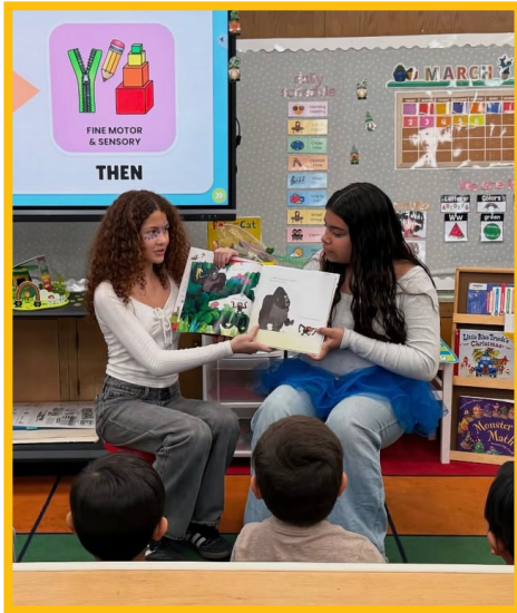
Newton Middle School students celebrated Read Across America week by reading to Kwis Elementary School students, fostering literacy across the District.

Hacienda La Puente Unified School District celebrated March as National Reading Month with key activities and spirited theme days that brought together students, teachers, parents, and staff during Read Across America Week from March 3 to 7 . This Districtwide collaboration sparked a love for reading, encouraged academic success, and strengthened a sense of community.