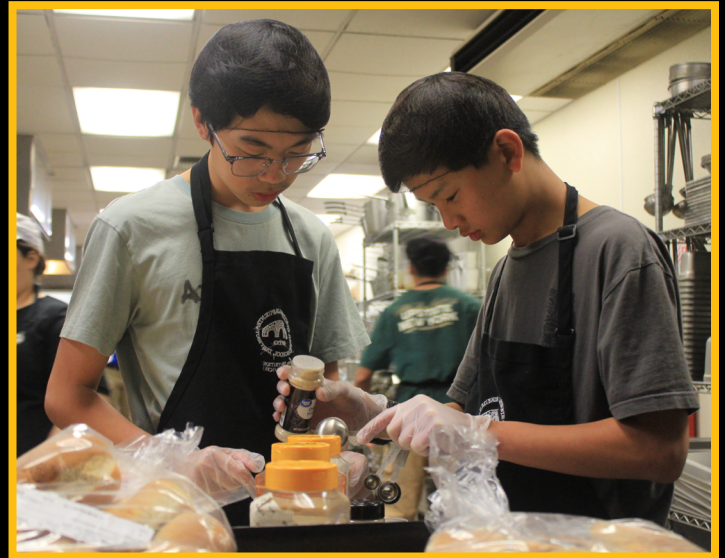
A Mesa Robles Middle School culinary team double-checks its supplies during Hacienda La Puente Unified's third annual Student Chef Recipe and Cookoff.

Read more about the Student Chef Cookoff on our District webpage .