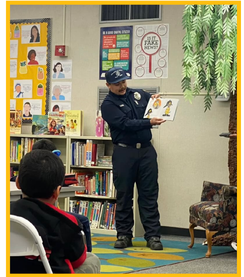
Valinda Elementary School combined Career Week and Read Across America Week by inviting local first responders to read to students, fostering connections between the community and the classroom.

The exchange of stories and ideas aimed to foster connections between the community and classrooms created a shared experience that spanned all ages and grade levels.