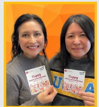
HLPUSD's Equity and Access department helps support the social, emotional, and physical development of our students to ensure they reach their goals and succeed.

The first week of March marked National School Social Work Week , a time to recognize the invaluable contributions of school social workers. We honored our dedicated on-site specialists and the Equity and Access team for their unwavering commitment to supporting students, educators, and the entire school community. Their dedication plays a vital role in creating a positive and inclusive environment for all.