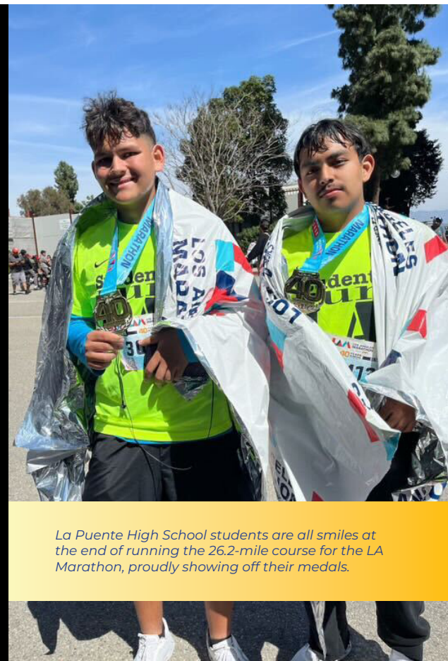
La Puente High School students are all smiles at the end of running the 26.2-mile course for the LA Marathon, proudly showing off their medals.