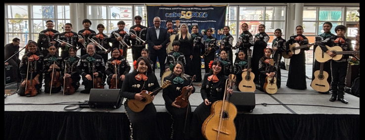
Mariachi bands from Orange Grove and Sparks middle schools collaborated in a unified ensemble for a performance at the CABE Conference on March 29.