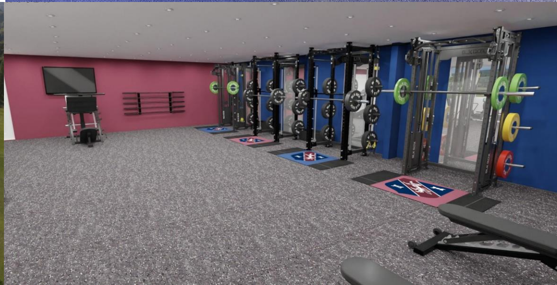
Image of refurbished Strength and Conditioning Suite, located in the Pavilion