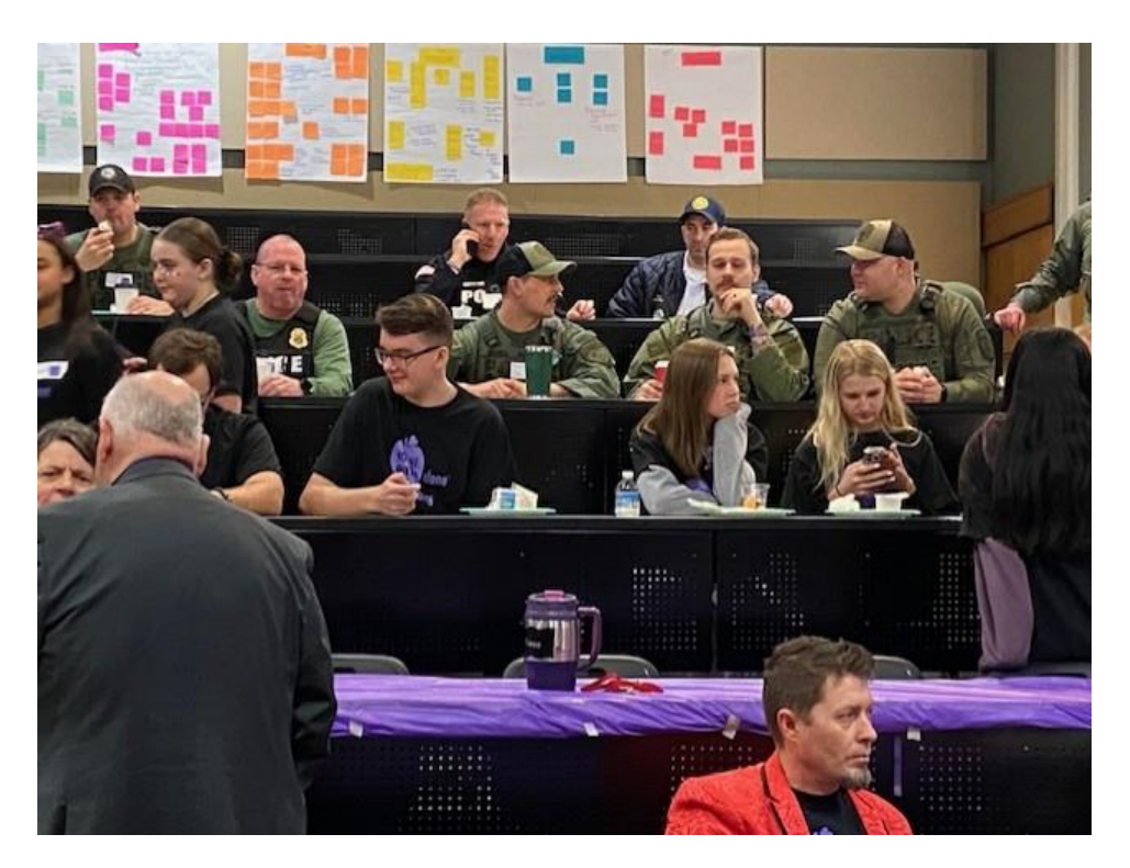
OIMS "No One Eats Alone"