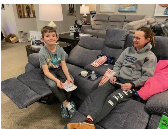
(EV Book BINGO at Raymour & Flanigan) Keep scrolling!!!!