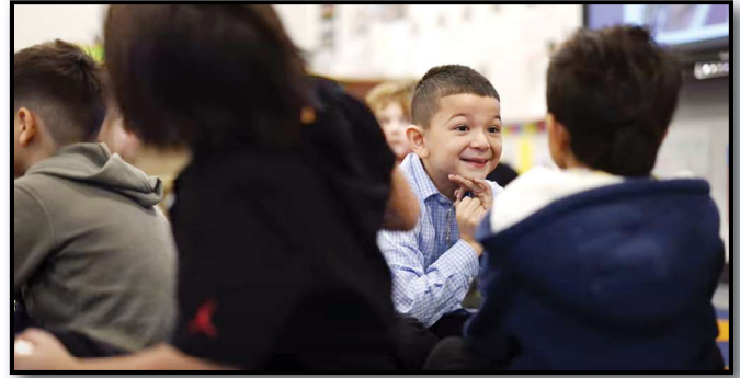
John Campbell learners are building toward their future. Scan the QR code to view.

This installment spotlights John Campbell Primary School. While pursuing the path of education, students are engaging in specialized technology, engineering, coding, and keyboard learning, which connects them to early pathways where they can discover their interests and abilities, and explore career opportunities. Driven by their eagerness for learning, and using their cumulative knowledge, growing problem-solving skills and imagination, John Campbell learners are enhancing the foundation on which to stack the building blocks to their future.