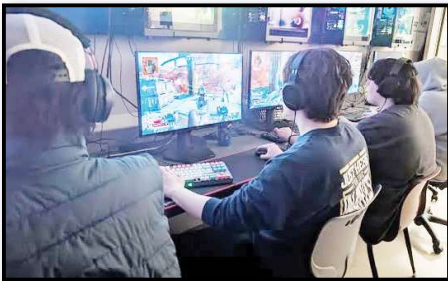
For Selah High School Esports athletes, the competition is more than just a game.

A new sports season has recently begun and eager Selah High School participants have been fine-tuning their skills in order to deliver peak performances during the clutches of competition. Athletically