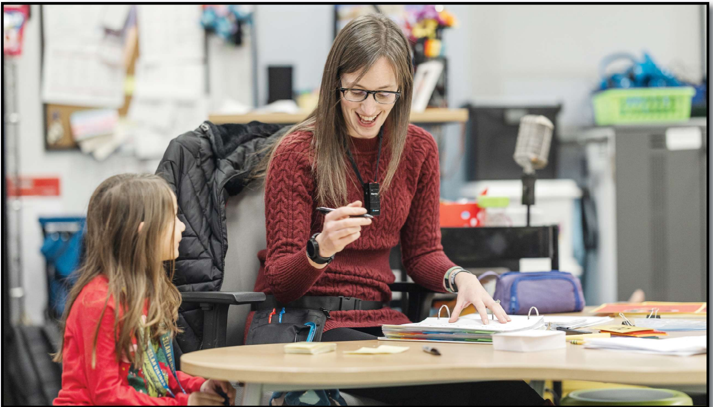
Their faces say it all — Selah students and staff love learning!