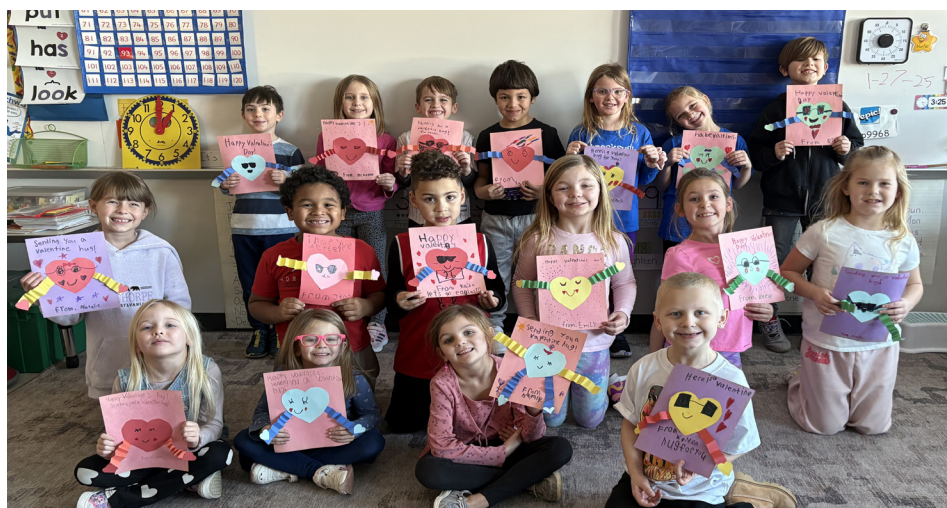
Schnecksville Elementary students made Valentine's cards for senior citizens residing in assisted living and skilled nursing facilities.