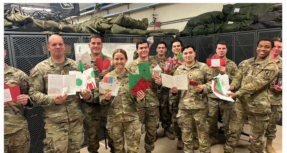
Ironton Elementary students made 400 Holiday cards for an Administration Center employee's son who spent the holidays with his Army Airborne Unit in Italy.