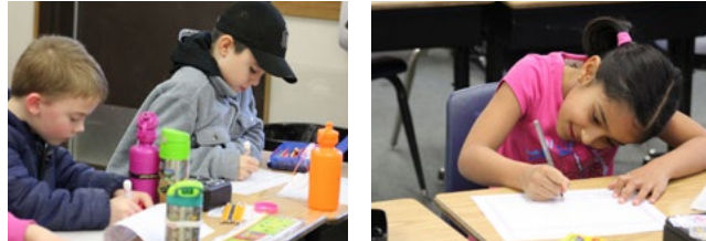
Top: Big buddies and little buddies at Cougar Creek Elementary read together after spending time making a craft. Bottom: Lakewood Elementary second graders learn the process of writing before a family Writing Celebration.