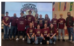
Eleven LHS wrestlers competed at state.

Lakewood has ordered three new electric school buses with $1.6 million in grants from the Washington Department of Ecology. The first bus was delivered in March with another bus arriving soon.