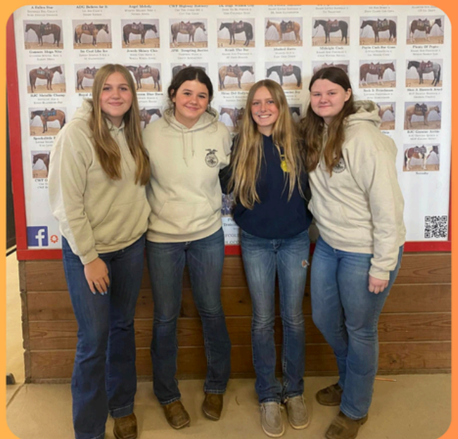
Equine team placed 8th and advanced to state!