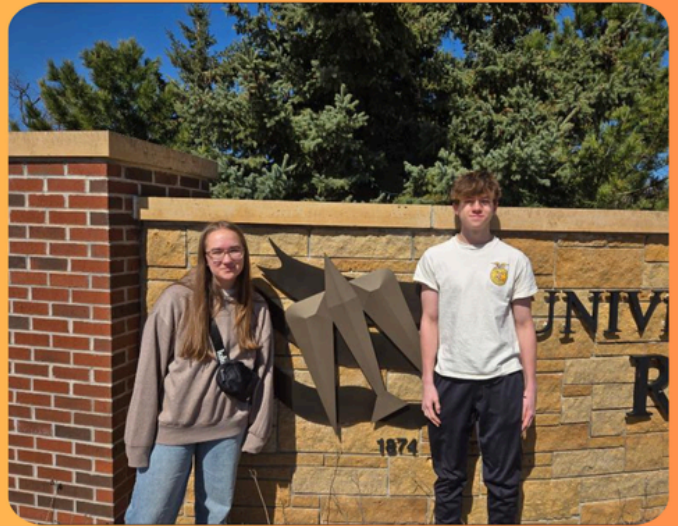
Floriculture Team placed 17th!

FFA members recently competed in the Career Development Events at UW - River Falls. Congratulations to all students!