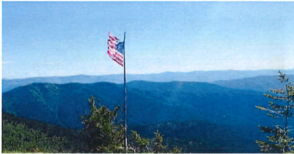
St. Joe National Forest

Our area is a land punctuated in beautiful blue flowing rivers, cascading over waterfalls, sitting still in azure lakes. In fact, there is no greater concentration of lakes in a western state than in the panhandle of Idaho.