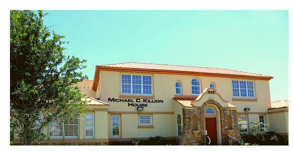
Centrally located, about 1/2 mile from the ECISD Administration Building