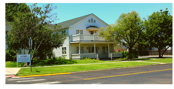
Located across the street from the ECISD Administration Building.