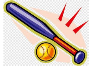
24-6A District Standings