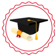
Honors Diploma Seal (Ohio)