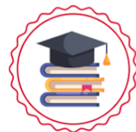
College Ready Seal (Ohio)