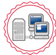
Technology Seal (Ohio)