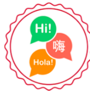
Biliteracy Seal (Ohio)