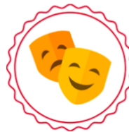
Fine & Performing Arts Seal (Local)