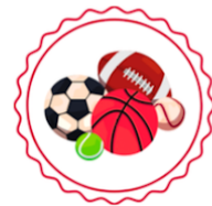
Student Engagement Seal (Local)