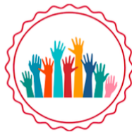
Community Service Seal (Local)