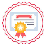
Industry Recognized Credential Seal (Ohio)