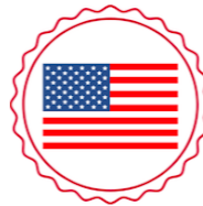
Citizenship Seal (Ohio)