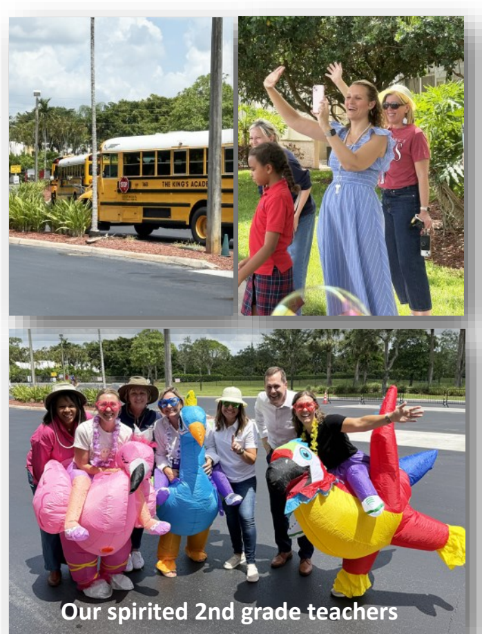
Our spirited 2nd grade teachers