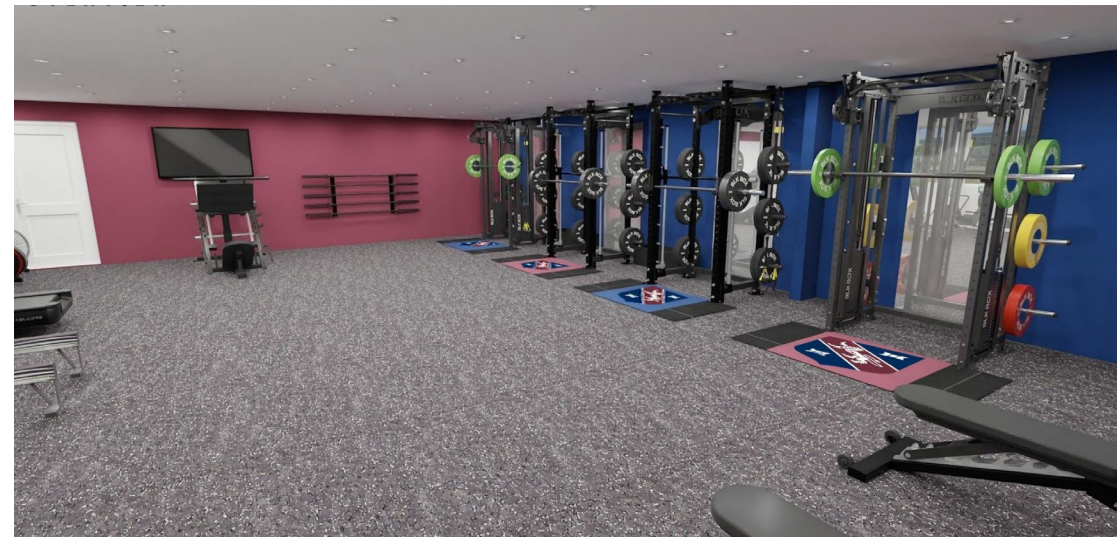
Image of refurbished Strength and Conditioning Suite, located in the Pavilion