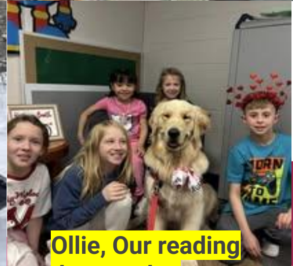
Ollie, Our reading therapy dog