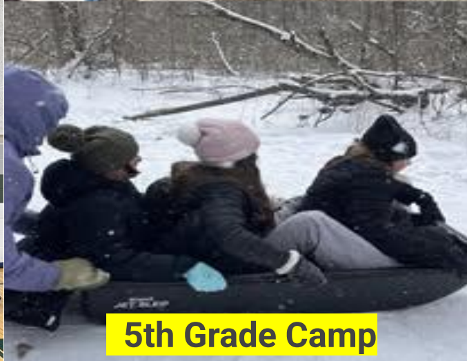
5th Grade Camp