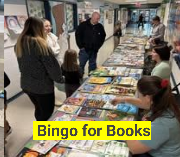
Bingo for Books