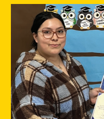
High School Diploma Program