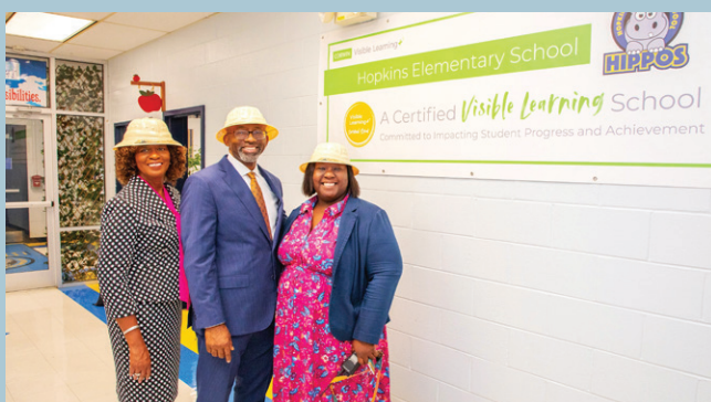
Hopkins Elementary School Visible Learning+ Certified School First Visible Learning+ Certified School in South Carolina