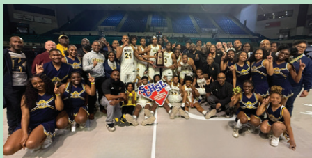
W.J. Keenan Boys Basketball Team