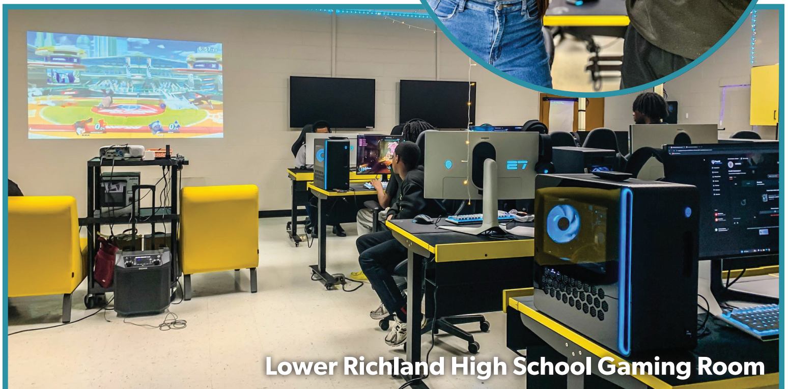
Lower Richland High School Gaming Room