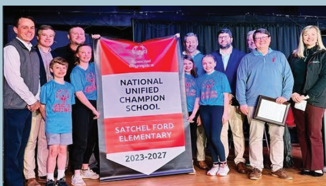
Satchel Ford Elementary School National Banner Unified Champion School Special Olympics