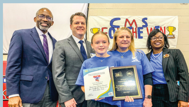
Crayton Middle School AMLE School of Distinction Association for Middle Level Education First AMLE School of Distinction in South Carolina