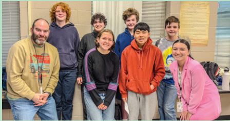
Dreher Quiz Bowl Team