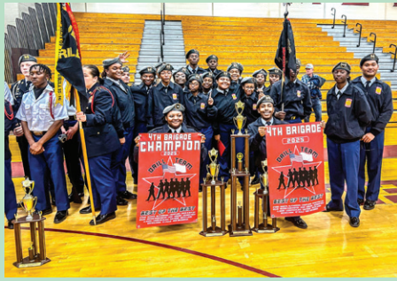
Lower Richland Army JROTC Drill Team