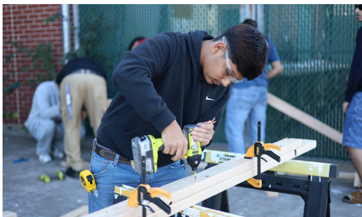
CHS Construction student

One of the center’s core goals is to ensure all students can access the career pathways they’re passionate about, regardless of which campus they attend. Matching programs to student interests across a district can be challenging, and the CTE Center aims to remove those barriers.