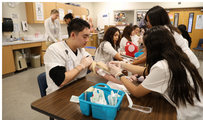
PHS Healthcare Therapeutics students

For PfISD, being “Pfuture Ready” begins now—and continues into the Pfuture. ♦