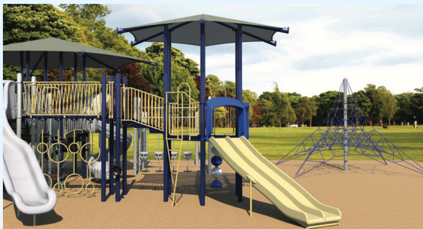
Everything in color is new. All of our current equipment is in gray.

Oak Grove opened its doors in 2004- and while our community and population has grown, our grade 1-8 play structure has remained the same. Over the last 3 years your Oak Grove PTA has set aside $110,000 from your generous donations to be able to expand and update our playground- but we're just short! With this upgrade came a few unexpected last minute costs. We need your support again to have our new play structure installed for the 25-26 school year. Rather than run another fundraiser, where we only get a percentage of the sales, we're coming to you for one last playground push!