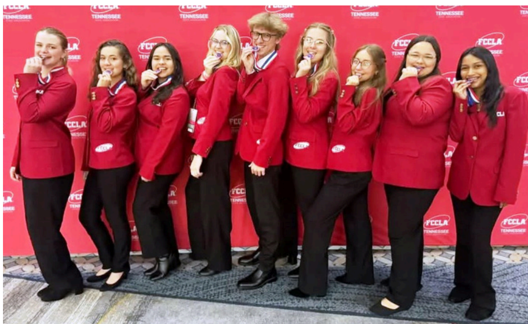
Above: Crockett County's FCCLA presentation winners do the Olympic pose and bite down on their hard-earned medals after first-place finishes at the State Leadership Conference in Chattanooga.