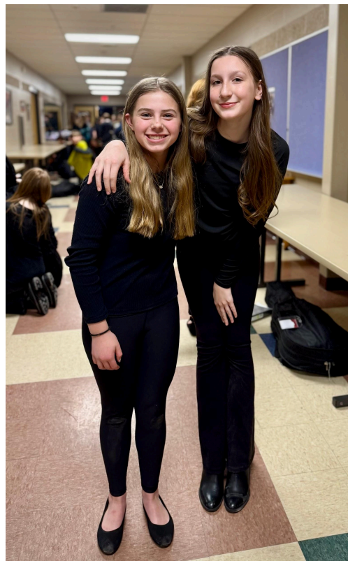
Orchestra Highlights (above) Band (below)