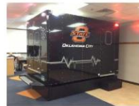
Enclosed Learning Model