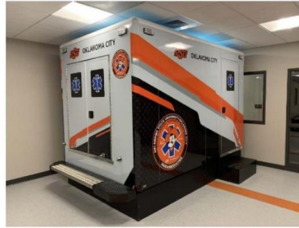
Simulator Solutions Proposal – Platinum Ambulance Simulator