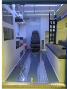
Platinum Simulator Proposal – Document is intended for exclusive use by Montgomery County Schools

Audio/Video Package: (Standard on all Models) Includes speaker system, four (4) fixed-position high-definition cameras with audio capability, and noise distraction system.