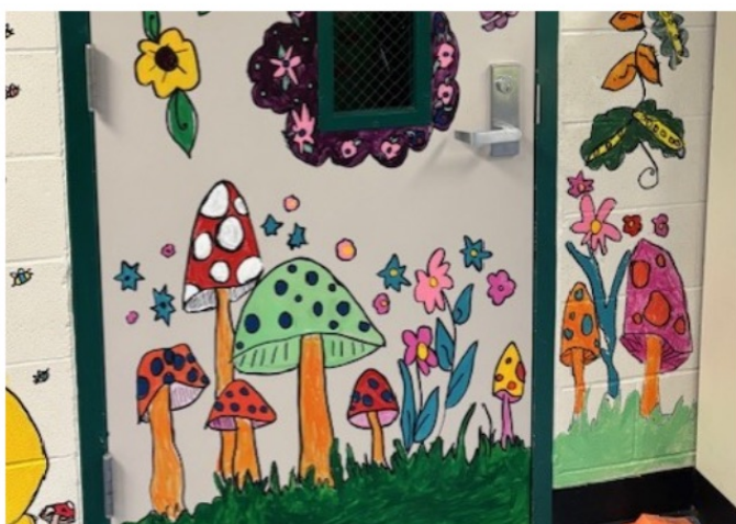
Foyer A is an enchanting garden scene.