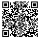
City of Bedford