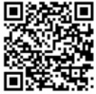
Bedford City School District

If you are looking for employment, visit these websites: