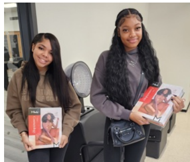
Members of the Cosmetology Class of 2026 enjoy their new text books.

The Bedford City School District is thrilled to announce the successful grand opening of our new cosmetology room. YES! The Cosmetology program is back in Bearcat Country after being gone for nearly 25 years, and the ribbon cutting ceremony was evidence that the program has been missed. The event was filled with excitement, as community members, staff, current students, and former cosmetology students gathered to celebrate this momentous occasion. Bearcats smiled from ear to ear while encouraging our students to dive into their stylish and creative learning journey in a newly renovated space filled with shiny new shampoo bowls, dryers, manicure stations and pedicure stations. The Bedford City School District is thrilled to offer our cosmetology students real-world experiences while empowering them with valuable skills and a head start on their future careers in a state of the art facility.