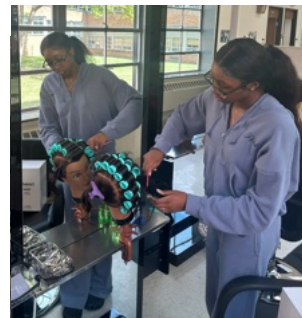
The newly renovated Cosmetology room has updated styling stations, manicure & pedicure stations, shampoo bowls, dryers, an esthetician room and a classroom.