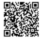
Village of Walton Hills