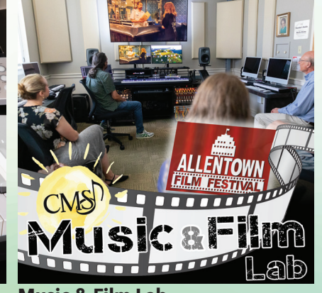
Music & Film Lab 2 Weeks: Mornings, July 14-25