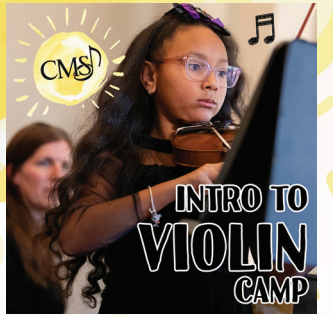
Intro to Violin Camp (1 Week) Session 1: June 23-27 Session 2: July 28 - August 1