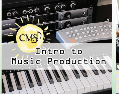
Intro to Music Production 6 Weeks: Evenings, June 17- July 29