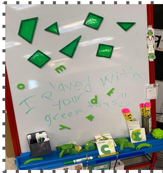
That sneaky Leprechaun!