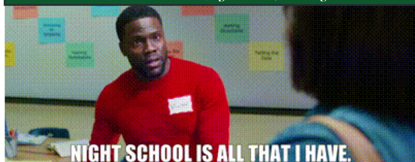
Photo from the movie Night School , on Google