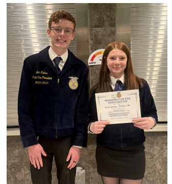
Intro to Horticulture 4 th Place at State