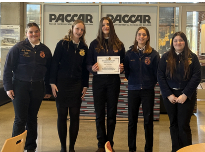
MS Environmental and Natural Resources Team 1 - 2 nd Place at State