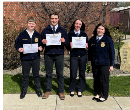
AG Tools & Materials - 1 st Place at State

LR FFA has been busy with district and state contests! These are the results from state events that have already taken place. FFA members will also be competing at the State FFA Convention in May!