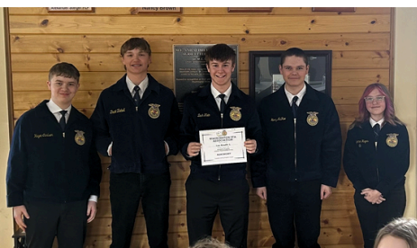
Agronomy Team 2 - 4 th Place at State