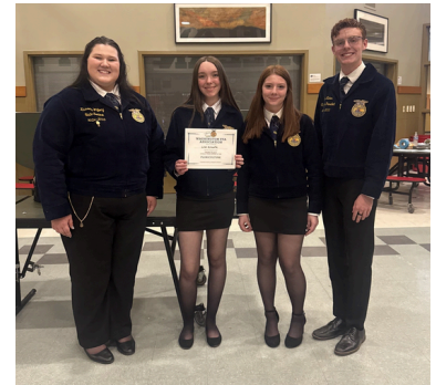
Floriculture Team - 3 rd Place at State