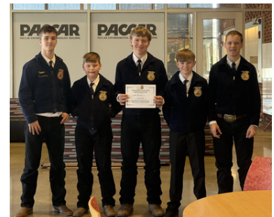
MS Environmental and Natural Resources Team 2 - 3 rd Place at State