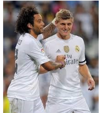
Marcelo (left) celebrating with Toni Kroos.