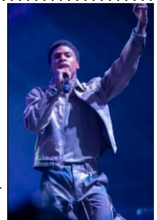
NLE Choppa, warming up for MIT.