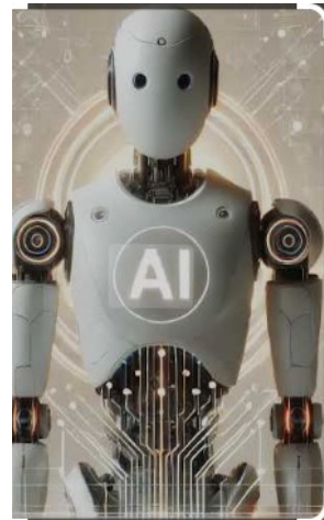
AI Robot Sent By Donald Trump