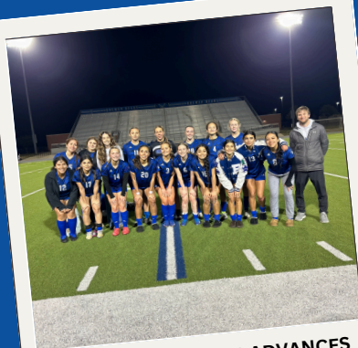
LADY BEARS SOCCER ADVANCES TO PLAYOFFS; HEAD COACH EARN 5-5A COACH OF YEAR