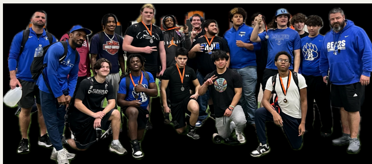
POWERLIFTERS ADVANCE TO STATE MEET