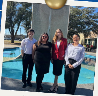
FCCLA STUDENTS ADVANCE TO STATE