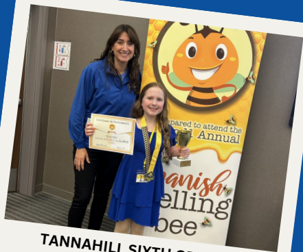
TANNAHILL SIXTH GRADER ADVANCES TO NATIONAL SPANISH SPELLING BEE