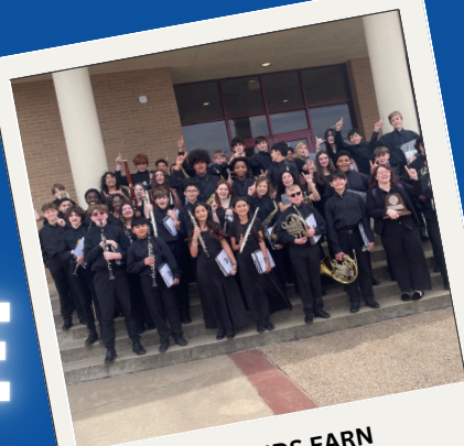
BMS BANDS EARN HIGHEST SCORES