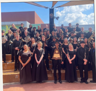
FIGHTIN' BEAR BANDS EARN AWARDS AT UIL CONCERT & SIGHT-READING CONTESTS