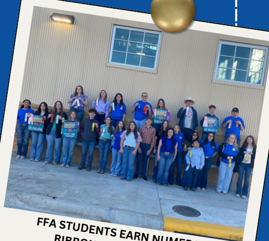
FFA STUDENTS EARN NUMEROUS RIBBONS AT FORT WORTH LIVESTOCK AND TEXAS MAJORS