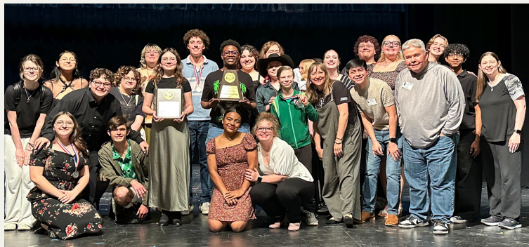
BHS THEATRE ADVANCES TO BI-DISTRICT UIL ONE-ACT PLAY COMPETITION