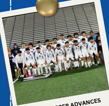
BOYS SOCCER ADVANCES TO PLAYOFFS