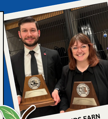
BMS BANDS EARN HIGHEST SCORES