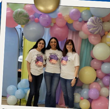
STUCO OFFICERS PARTICIPATE IN DISTRICT COMMUNITY SERVICE PROJECT