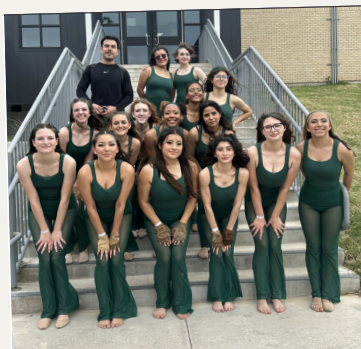
WINTERGUARD WINS 8TH OVERALL AT NORTH TEXAS CHAMPIONSHIPS