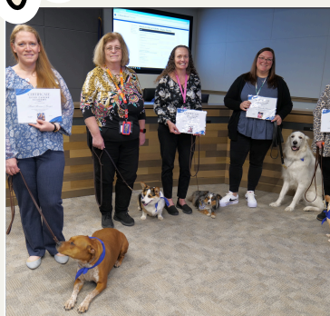
COMFORT DOGS EARN CERTIFICATIONS