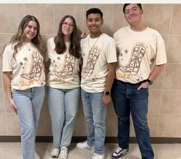
TAFE STUDENT ADVANCES TO NATIONALS