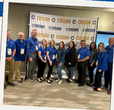
SCHOOL BOARD PRESENTS CTS PROGRAM AT NATIONAL CONFERENCE