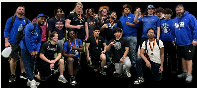
POWERLIFTERS ADVANCE TO STATE MEET