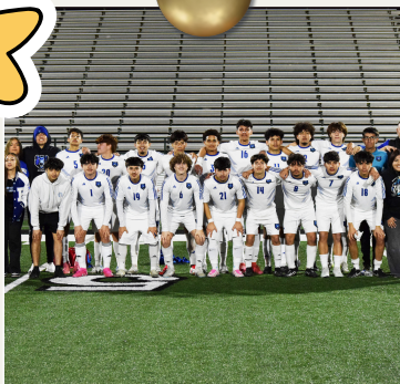
BOYS SOCCER ADVANCES TO PLAYOFFS