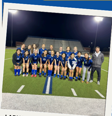
LADY BEARS SOCCER ADVANCES TO PLAYOFFS; HEAD COACH EARNS 5-5A COACH OF YEAR