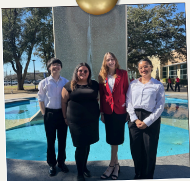
FCCLA STUDENTS ADVANCE TO STATE