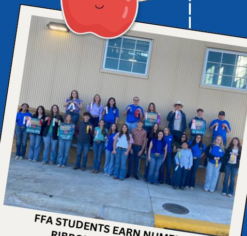
FFA STUDENTS EARN NUMEROUS RIBBONS AT FORT WORTH LIVESTOCK AND TEXAS MAJORS