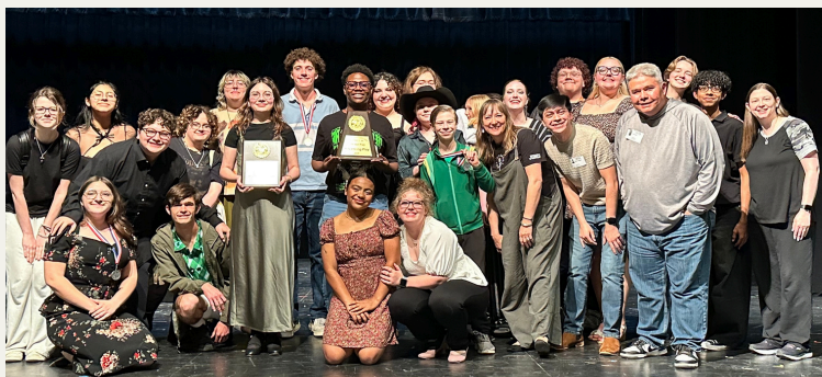
BHS THEATRE ADVANCES TO BI-DISTRICT UIL ONE-ACT PLAY COMPETITION