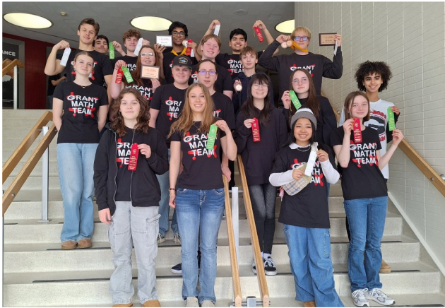
Grant Mathletes at Regional Competition

The Math Team had a strong showing at their Regional competition on Saturday, February 22, placing 5th out of 12 teams. Several Bulldogs secured top finishes and qualified for State, including: