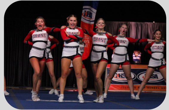
Varsity Cheer Performs at State

Although they were unable to complete their second routine, they earned an impressive 89.06 and finished 13th in the state! We are so proud of this team and all they have accomplished this season.