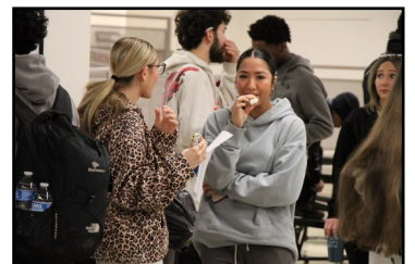
Seniors Class at the Be On Time Challenge Ice Cream Social