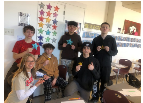
3rd Hour—Best Poems