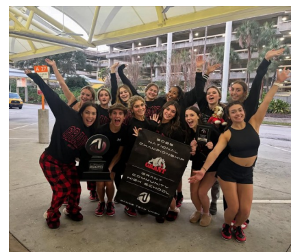
Varsity Dance Team Takes 14th at Nationals

Fresh off their 8th-place finish at the IHSA Dance State Finals, the Varsity Dance Team traveled to Florida to compete at Nationals, where they secured an impressive 14th-place finish in the nation! Congratulations to the team on a remarkable season and for representing Grant with talent and pride on the national stage!