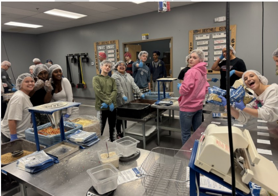
Freshman & Sophomore Class Council Volunteer at Feed My Starving Children

This small act of kindness reflects the power of words and the importance of connecting across generations. Thank you to our students for sharing their time and creativity to make a difference!