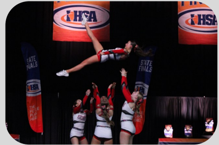
Varsity Cheer Performs at State