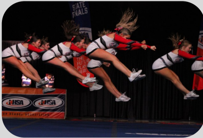
Varsity Cheer Performs at State