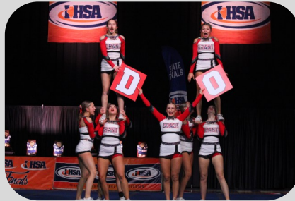
Varsity Cheer Performs at State