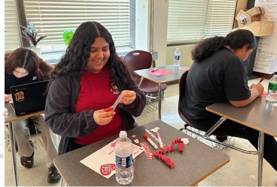
Students Create Valentine's Day Cards

English students put their writing skills to heartfelt use by creating Valentine's cards for seniors in our community. With thoughtful messages and creative designs, the students aimed to brighten someone's day and spread a little extra love this season.