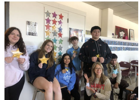
8th Hour—Best Poems