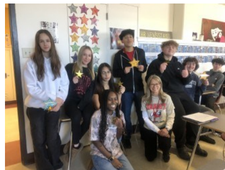
4th Hour—Best Poems