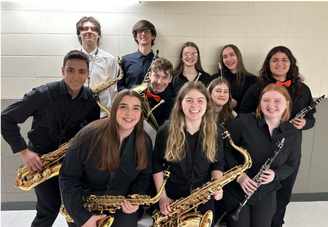
Grant Band Members

The 7th annual NLCC Invitational Honor Band Festival was held on February 10 and 11 at Wauconda High School. Eleven Grant Band students were selected to participate in it! The students prepared an extremely advanced repertoire. The two bands that performed at the Invitational Concert were the Ninth & Tenth (9 & 10) Grade Honor Band and the Eleventh & Twelfth (11 & 12) Grade Honor Band.