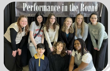
Performance in the Round Cast