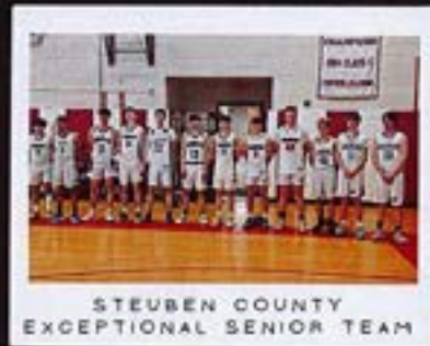
STEBEN COUNTY EXCEPTIONAL SENIOR TEAM