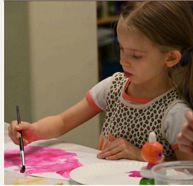
This HomeWorks! student paints during an art class at the HomeWorks! campus on March 4.