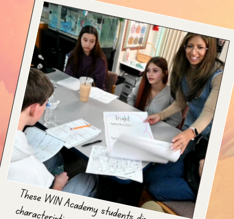
These WIN Academy students discuss the characteristics associated with right-brain dominant individuals on March 10.