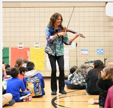
Mark Wood, the original string master of the Trans-Siberian Orchestra, treated students of Sunset Elementary to an electrifying concert on March 19.