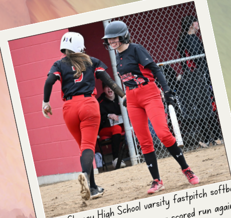
These Cheney High School varsity fastpitch softball players are all smiles following a scored run against Central Valley on March 21.