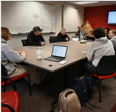
Members of the High School Superintendent Student Advisory Team discuss ways to foster connectedness and inclusion throughout the district.