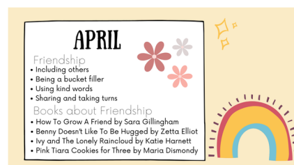
April - Friendship