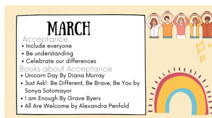
March - Acceptance

Monthly classroom lessons are focused on important character traits. Each month we recognize students from each class that demonstrate the qualities of our character trait of that month.