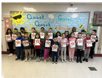
February Recipients - Perseverance