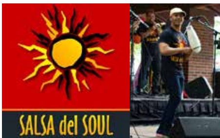
SALSA del SOUL performing August 2 & 21