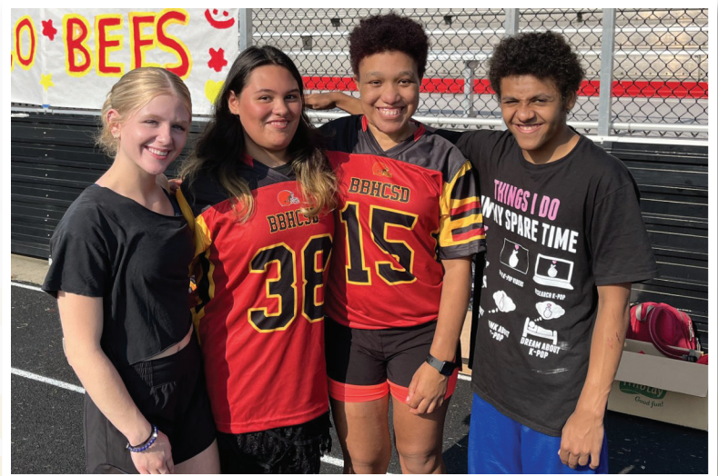
BBH's United Team hosted nearby schools recently for organized competition!

The Brecksville-Broadview Heights High School Unified Sports Team proudly hosted its very first flag football competition on Thursday, September 12, 2024, at the stadium. Several area high schools joined in for some friendly competition on the gridiron, including Strongsville, Max Hayes, St. Edward, North Olmsted, Cuyahoga Falls, and Highland. Each school's team had a chance to be introduced running through the iconic Bee inflatable before the start of the competition. After a stirring performance of The Star-Spangled Banner by members of the BBHHS Chamber Choir, the event kicked-off with multiple games occurring simultaneously on the turf field. Unified Sports provides meaningful opportunities for both students with special needs and their student partners to interact, collaborate, and form friendships through various team sports activities. A special thank you to our Unified Sports advisors, staff, and students for providing a fun, welcoming environment for all participating schools! Go Bees!