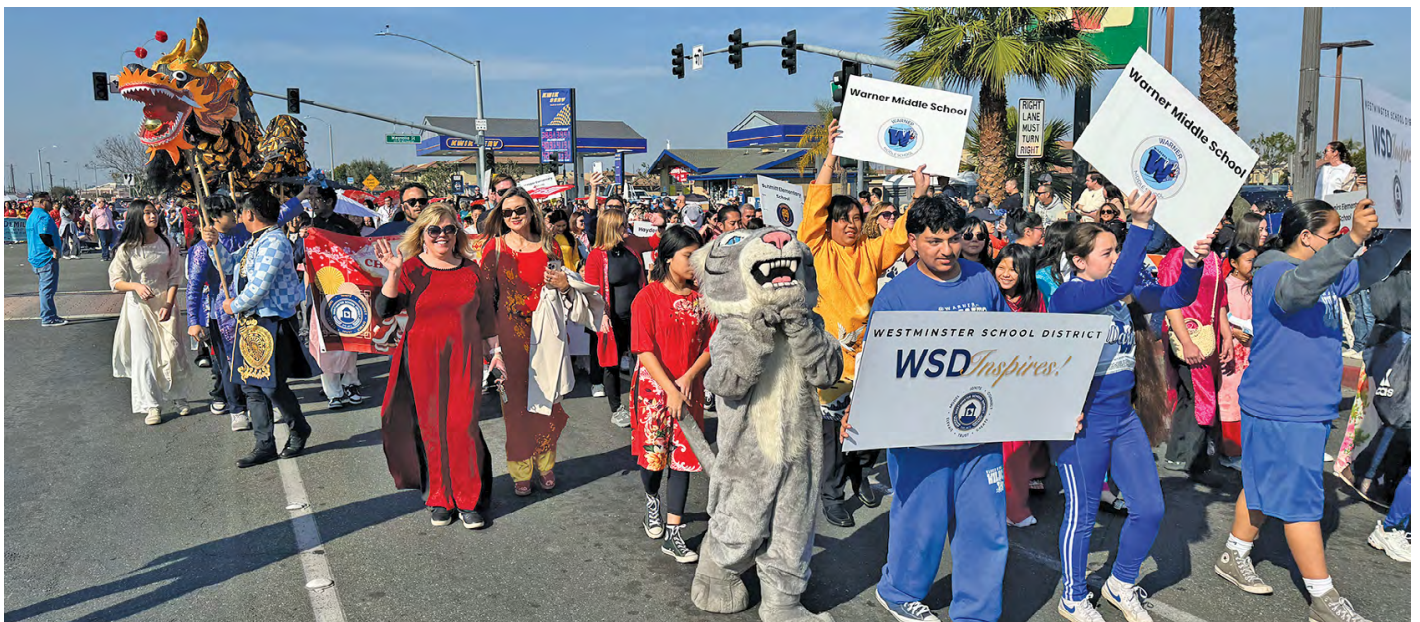
WSD Shows up in Full Force During the City of Westminster's Annual Tết Parade