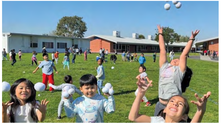
Throwing Kindness Snowballs