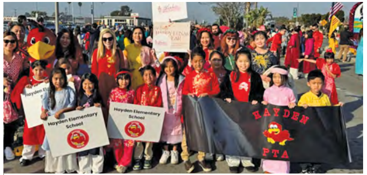
Lunar New Year Parade

At Hayden, learning goes far beyond the classroom walls. Whether through cultural celebrations, creative arts, science exploration, or community-building activities, we continue to create meaningful experiences that bring our school community together. We are grateful for the participation of our amazing families and can't wait for more exciting events to come!