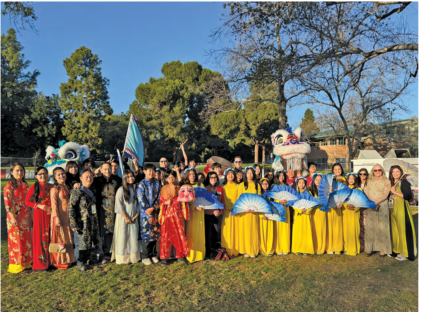
Vietnamese American Cultural Club (VACC) students showed off their talents on the main stage at the UVSA Têt Festival.

Let's carry this momentum forward as we continue to inspire, connect, and elevate one another in the months ahead!