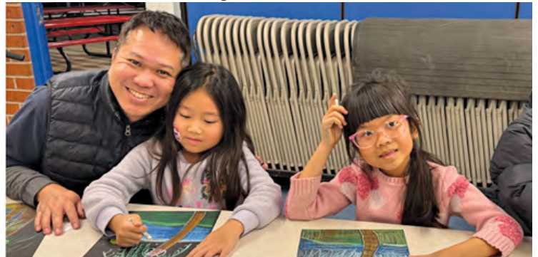
Family Art Night