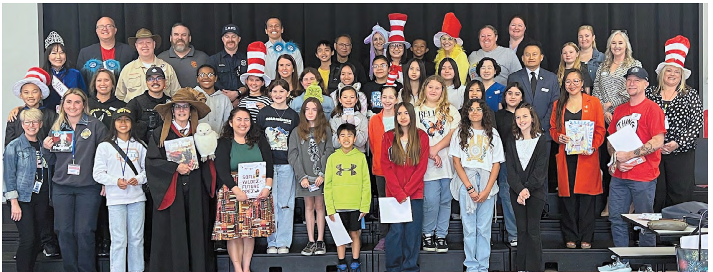
Read Across America Day Guest Readers & Student Ambassadors