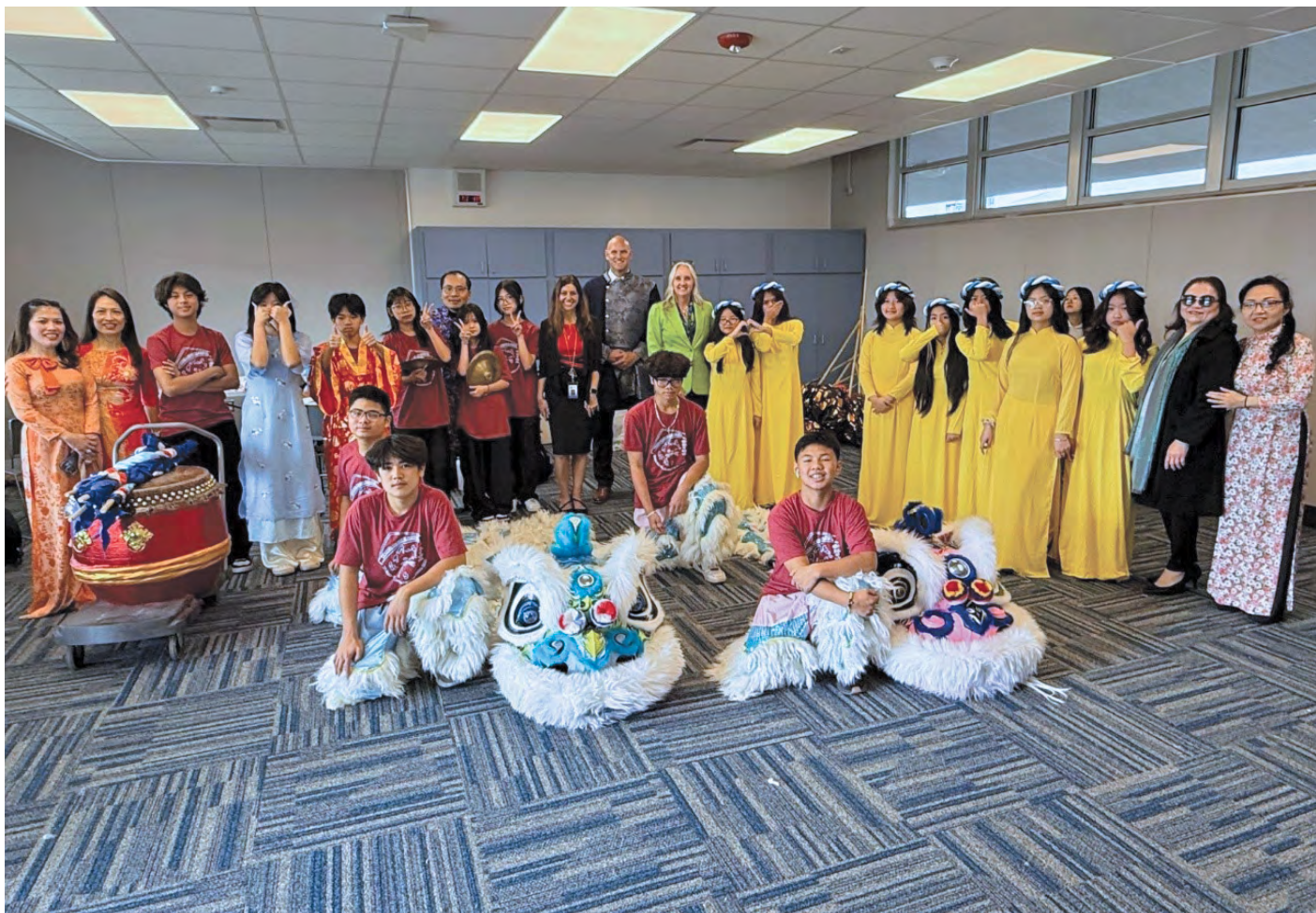
The Warner Middle School Lion Dance Team and our Fan Dance Team

Another wonderful program is our school’s Lion Dance Team. This is the first year that any school in the Westminster School District has had a Lion Dance Team and the first year that Warner has had a formal Fan Dance team. Our great dancers got to perform at both the Westminster Tết Festival and will also perform on the main stage at the annual CAFE conference in March. We are so proud to have brought these programs to Warner and are so proud of these students.