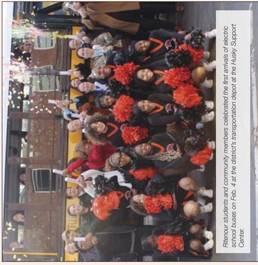
Ritenour students and community members celebrated the first arrivals of electric school buses on Feb. 4 at the district's transportation depot at the Husky Support Center.