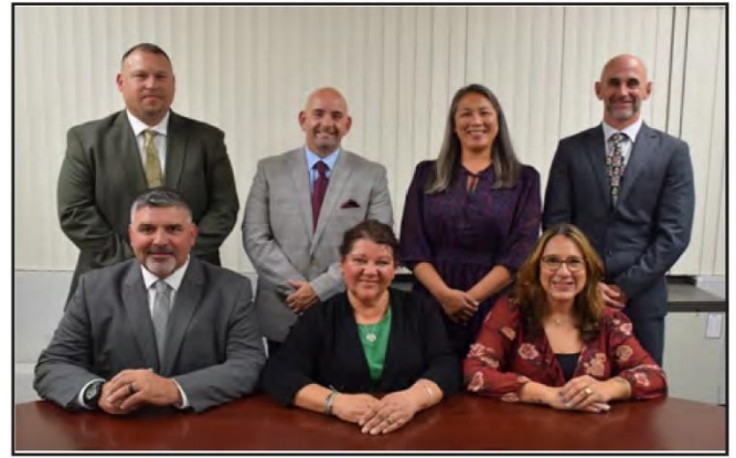
The William Floyd Board of Education

The district recently conducted the New York State Education Department's required five-year building condition survey, which has identified several areas that will need to be addressed to continue keeping all buildings operational, safe and compliant to all New York State codes.