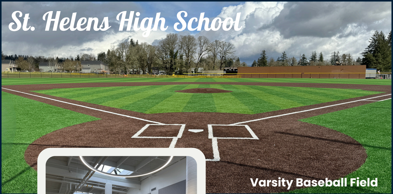
Varsity Baseball Field