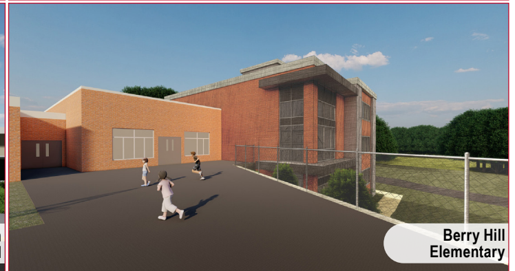
Berry Hill Elementary