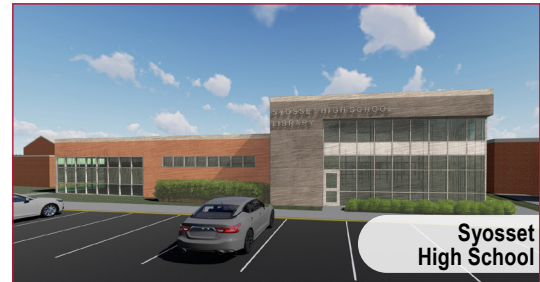
Syosset High School

Applications are available on the District's website. Absentee ballot applications must be mailed back to the District no later than the seventh day before the election or delivered in person back to the District no later than the day before the election.