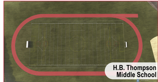
H.B. Thompson Middle School