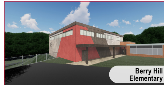
Berry Hill Elementary