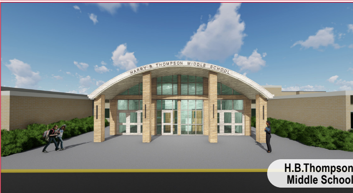
H.B. Thompson Middle School