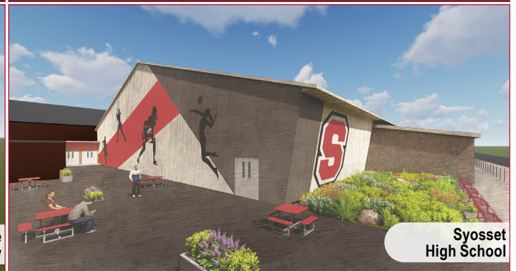
Syosset High School

In compliance with Section 203 of the federal Voting Rights Act, election information is offered in English and Spanish.