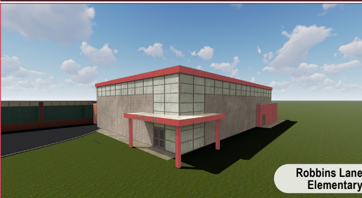
Robbins Lane Elementary