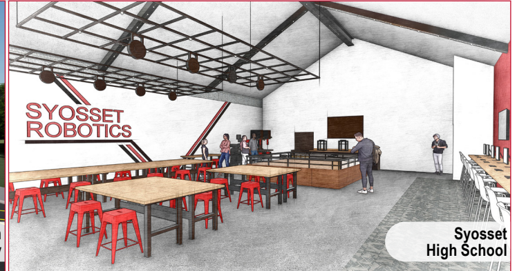
Syosset High School