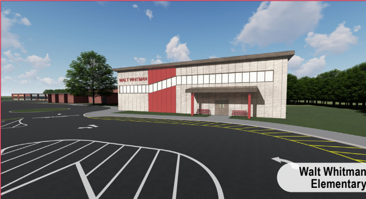
Walt Whitman Elementary

FACILITIES REFERENDUM: TUESDAY, OCTOBER 1 POLLS OPEN 6AM TO 9PM