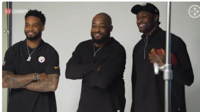
Darius Slay (left) and DK Metcalf (right) with Steelers Head Coach Mike Tomlin (middle)

Other moves on offense include trading our main runningback Najee Harris to the Los Angeles Chargers. Despite his strong performances