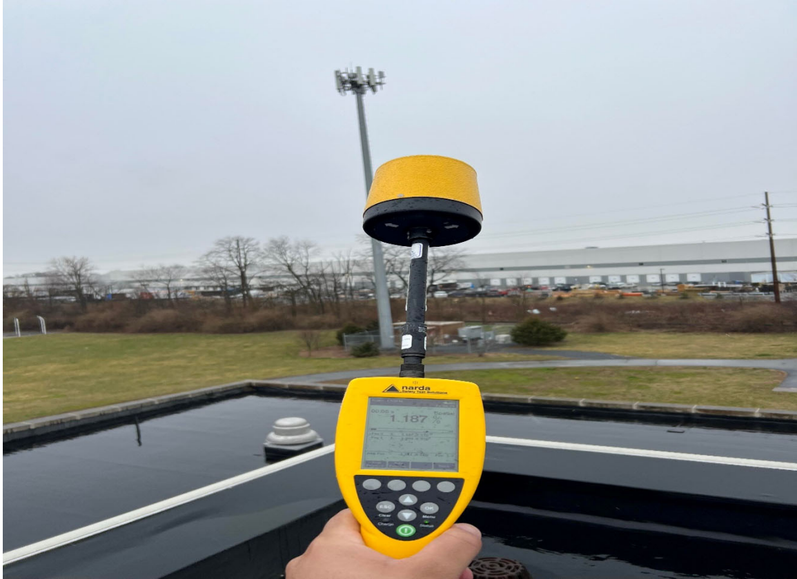
Narda Meter and Probe