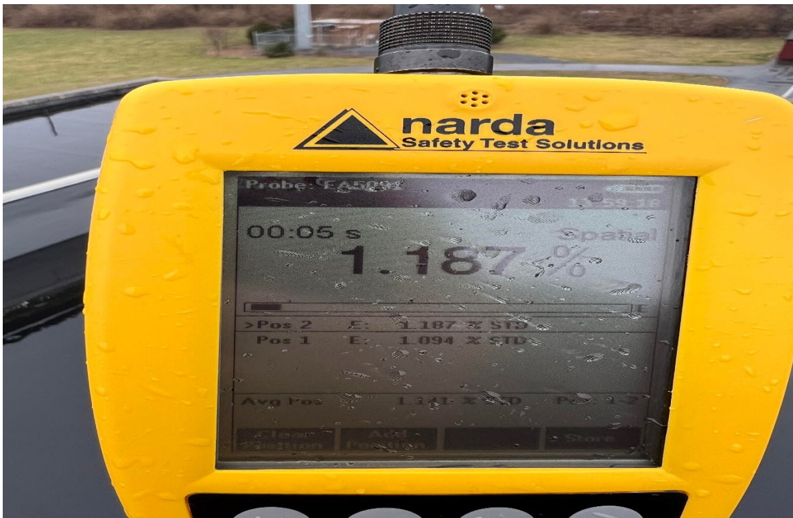
Narda Meter Display