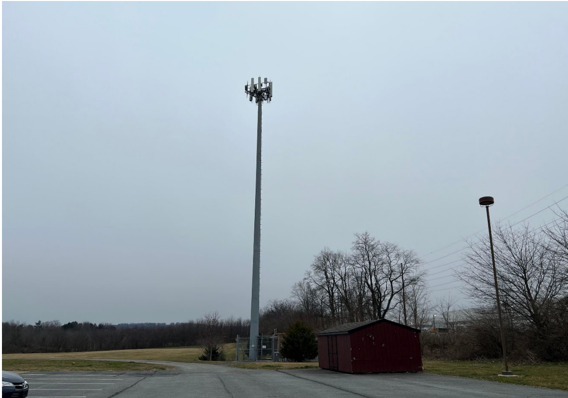
Monopole with Cell Antenna Installation