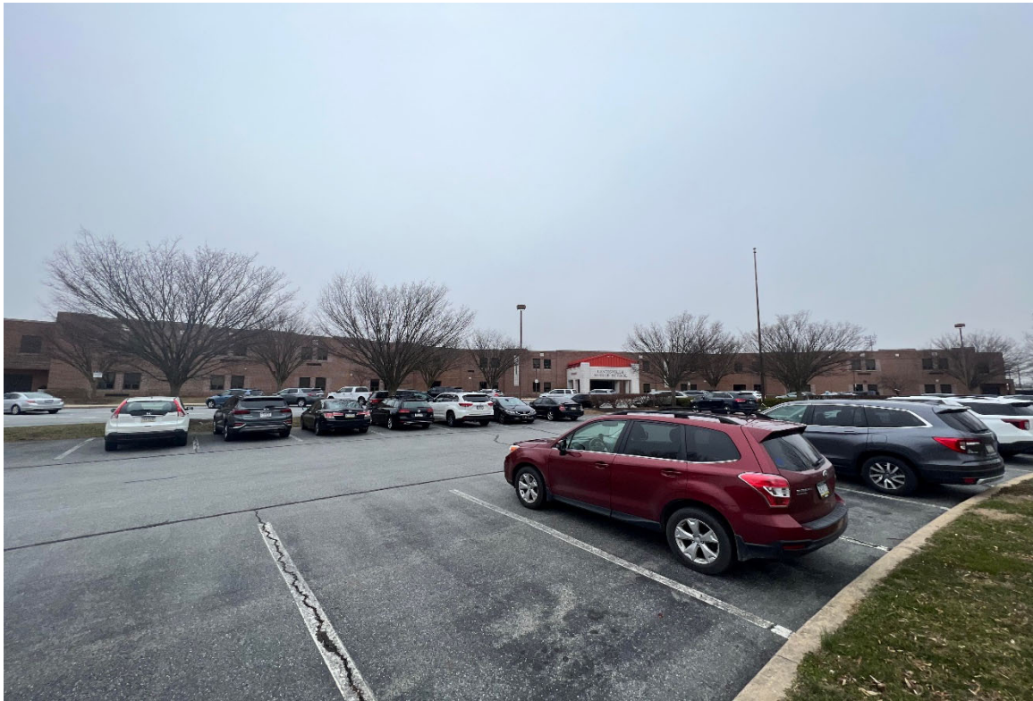
Front of School